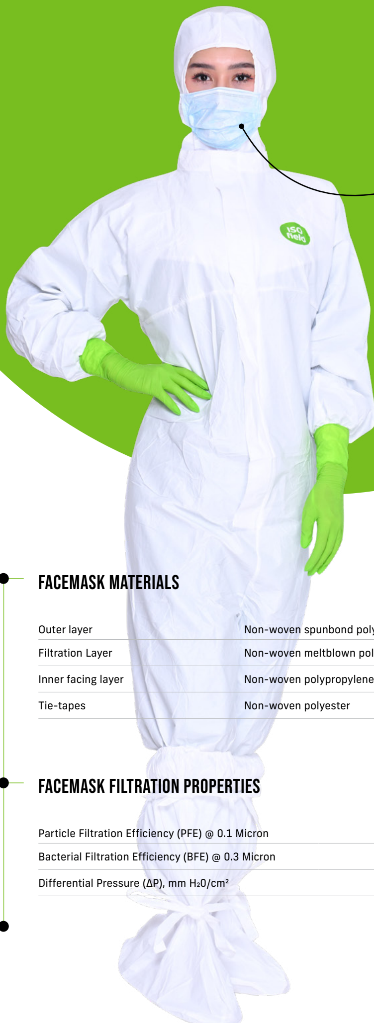
Hood with Integrated Tie-on Facemask