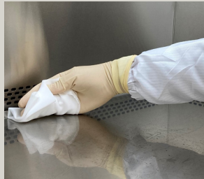
GLOVE ROLL DOWN